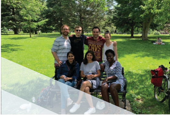
Ohio State Fulbrighters gather at Goodale Park