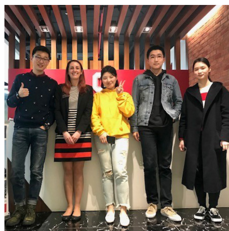
Moritz College of Law implemented program at Shanghai University of Political Science and Law