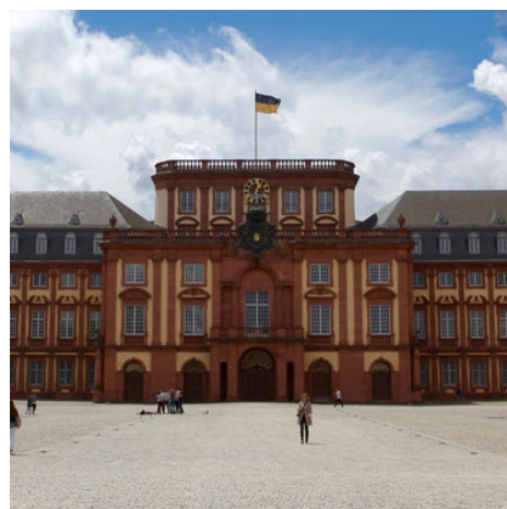
University of Mannheim